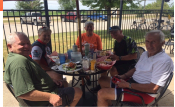
~article and pictures from Ruth Van Tol