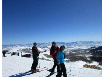
Park City / Deer Valley trip in 2016

Another highly recommended, whole group experience, is a day trip to the Sundance Resort. There are live participation activities, such as, silver-smithing, making cheese and