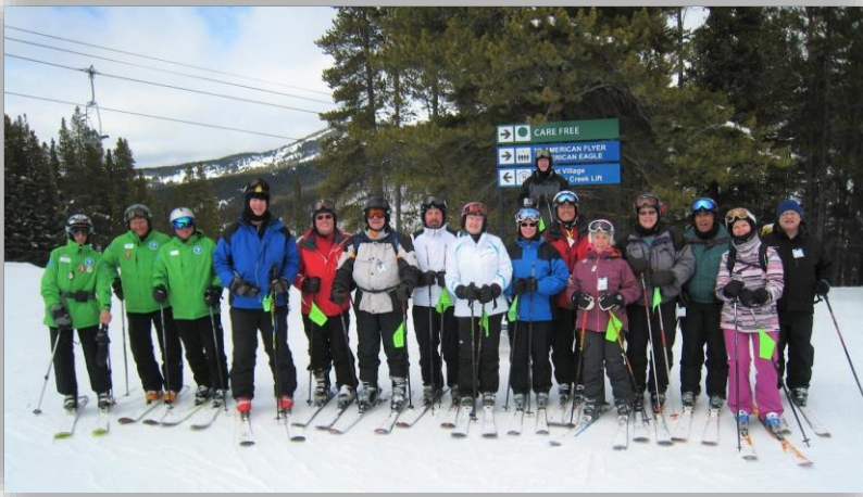
2015 EISC Copper Mountain trip

For years, guests have enjoyed staying at the Mountain Plaza complex for its spacious and comfortable accommodations conveniently located at the base of the American Eagle Lift in the Center Village. On-site indoor and outdoor hot tubs, sauna, dining and a lobby warmed by its gas fireplace make Mountain Plaza a good choice to enjoy a relaxed mountain environment, while being steps away from skiing. The building, built in 1979, features complimentary wi-fi, heated underground parking and laundry facilities. 1 vehicle per unit with a kitchen receives garage parking. Additional vehicles may park in the free outlying lots or choose to pay for parking in the interior village lots.